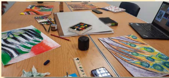
Creating Art through Music Taster Workshop, March 2024