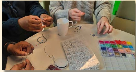
Creating Jewellery Workshop, Evergreen Unit, March 2024