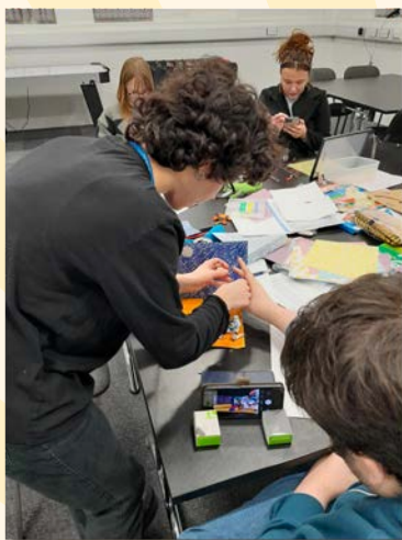
Animations for Wellbeing Workshop, Bedford, March 2024