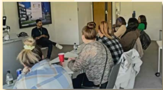
Mentally Wealthy Programme, University of Bedfordshire, March 2024