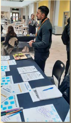
Online Safety Awareness Event, Barnfield College, April 2024